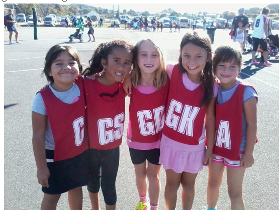
Oturu Misfits team

"They were a lot more prepared, and not freaking out about coaching," she said.